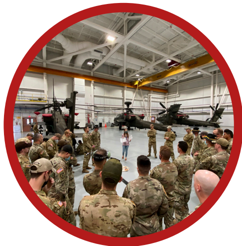
Briefing soldiers on soldier and family health and welfare.

We pride ourselves in having something for everyone in our community and this includes the Soldiers, veterans, and families on and around Fort Drum. We have staff directly on Fort Drum connecting Soldiers and families to Army, community, and CCE services, as well as education and support.