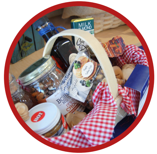
Taste NY Gift Baskets - keeping the community connected to local foods.