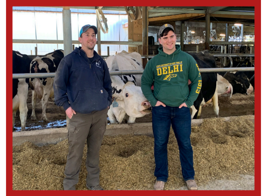
Farm Ops Participant interning at a local dairy farm learning the ins and outs of life on a farm.