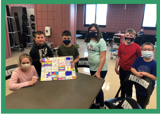
Students at the Belleville Henderson 4-H Afterschool Program making a Pax Puzzle. A Pax Puzzle works to create peace, starting in the classroom.

In a year with many challenges, 4-H was excited to provide in-person programs through afterschool, the Jefferson County Fair, and 4-H Camp Wabasso. This helped provide a bit of normalcy in anything but a normal time.