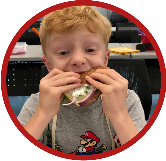
Trying new foods during Fort Drum Cooking Classes.

During the COVID-19 pandemic, local food was on everyone's mind. Consumers wanted guaranteed access to food products and producers wanted to capitalize on that demand. Wanting to support the needs of our local community, all of our program areas have played a part in connecting the community to local foods this year.