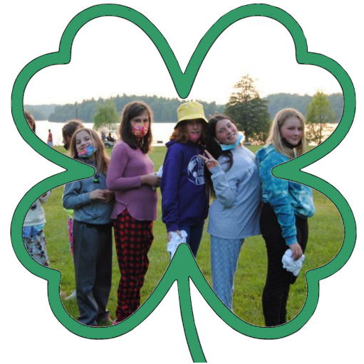
Making life-long friends and memories at 4-H Camp Wabasso!

“My child was hesitant to attend 4-H at the beginning of the year due to feeling overwhelmed by school and struggle with peer relationships. Through consistent encouragement from myself and the 4-H team he went from never wanting to attend to requesting to attend daily and participating in extra activities.”