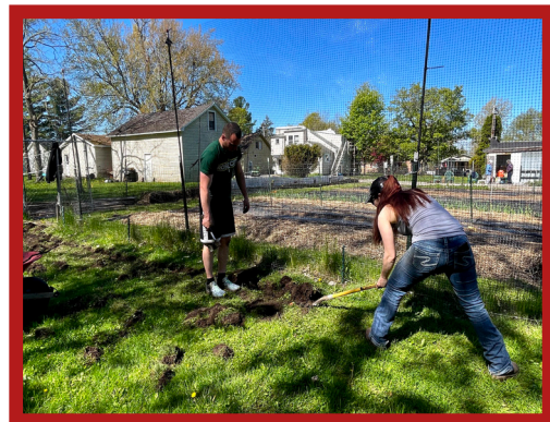
New Master Gardeners beautifying the community at the Urban Mission Garden!