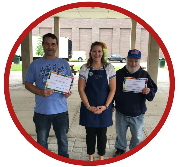
Improving health outcomes through the Fruit & Vegetable Prescription Program.

"The weekly produce bag we can purchase is a great budget stretcher!! I'm enjoying trying new things & old things cooked differently! Having this program offered makes a difference for me."